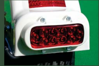
LED Lights with Lifetime Warranty