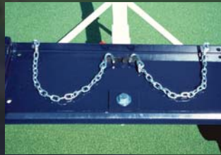
Towed Vehicle Secure Chains