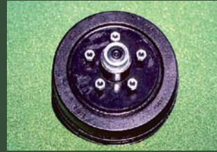
Electric & Surge Drum Brakes