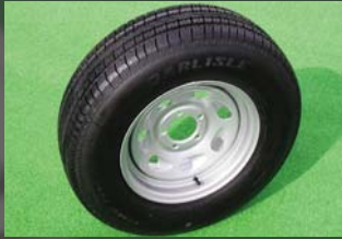
14" Radial Tire