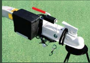
Electric Brakes Break Away Kit