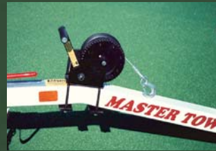
Bolt On Winch Kit