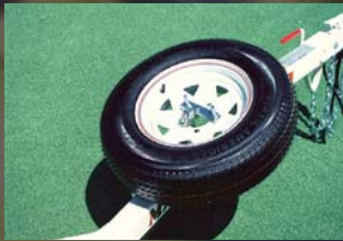
Spare Tire & Mount Kit