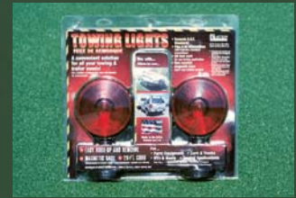
Magnetic Light Kit